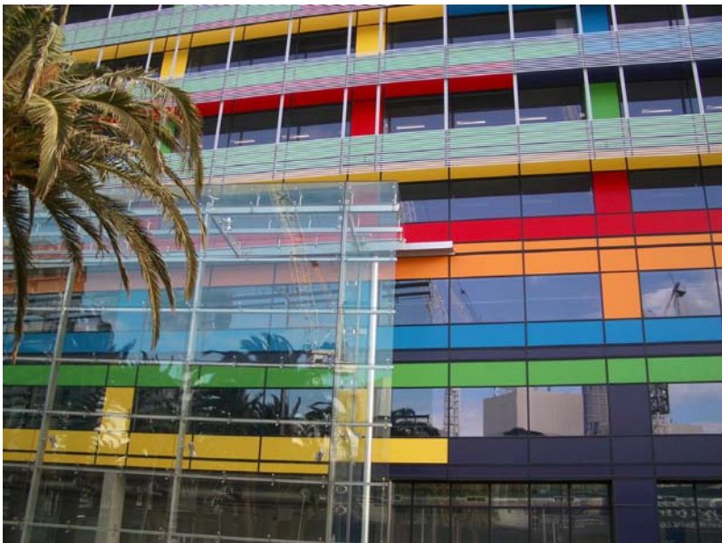
NAB Headquarters, Melbourne