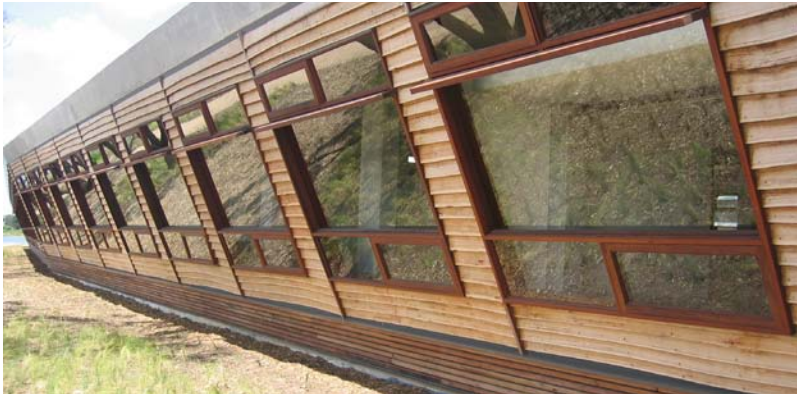
DPI Queenscliff Centre, Melbourne